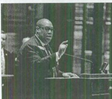
Rep. Taylor speaking in the House against HB 816, a bill to drug test

HR 2187 – Constitutional Amendment for a minimum wage that increase with inflation